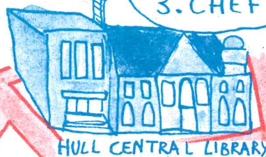
HULL CENTRAL LIBRARY

1. POOP ON PEOPLE 2. BOB CARVERS - STEAL CHIPS 3. CHEF